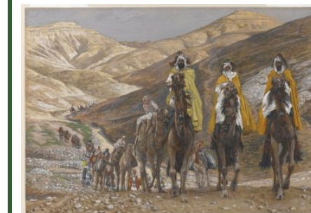
The Magi Journeying James Tissot, 1886 - 1894