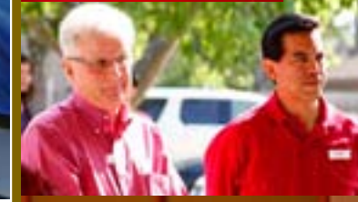
Palm Sunday Holy Week Tenebrae