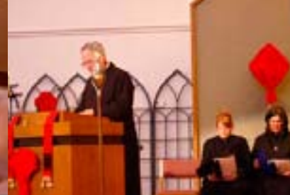
Maundy Thursday Good Friday Easter Vigil