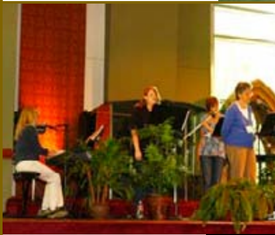
Women's Lenten Retreat